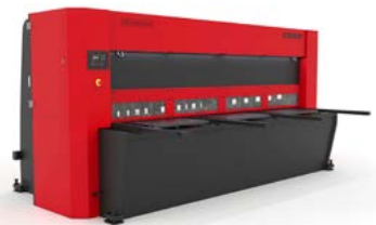
HYDRAULIC SHEAR MACHINES