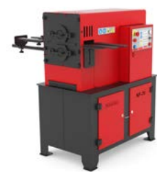
END WROUGHT IRON MACHINES