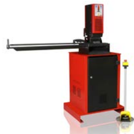
PRESSES FOR LOCKS