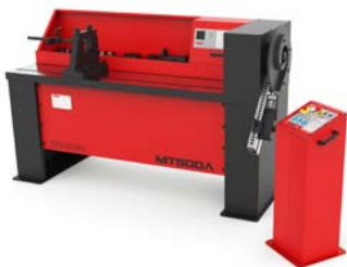
TWISTING/SCROLL BENDING MACHINES