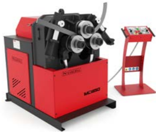
SECTION BENDING MACHINES