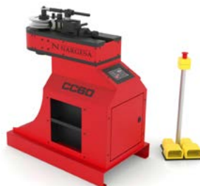
NON-MANDREL PIPE BENDER