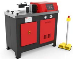
HORIZONTAL PRESS BRAKES