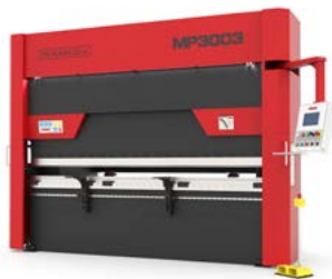
HYDRAULIC PRESS BRAKES