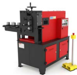
IRON EMBOSSING MACHINES